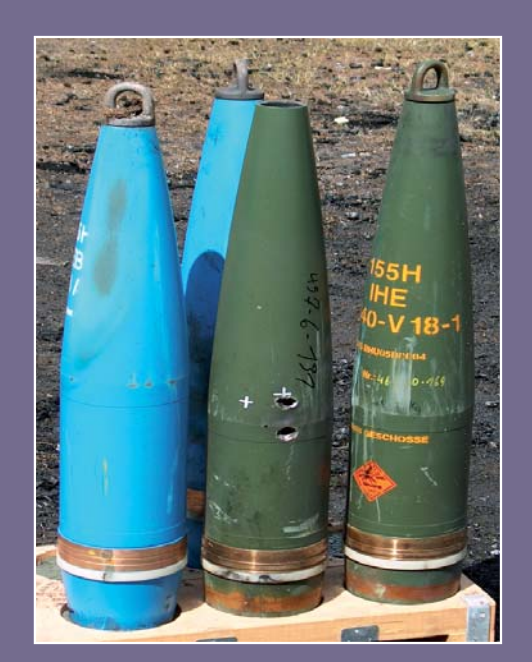
Rheinmetall IM shells after bullet attack

The mass production of this IM shell is starting. The process engineering of a formulation with 90% of solid and only 10% of a special binder system was a big challenge.