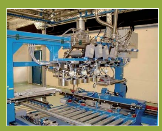
Filling heads and pallet conveyor of the Glascoed (BAE Systems – Land Systems) facilities in UK

Production of Insensitive Munitions loaded with cast-cured PBXs. IM compatibility allows the PBX curing facilities to be licensed as Hazard Division 1.3.